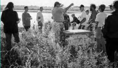
UDPREP Watershed Tour

Our annual watershed tour is a valuable opportunity to share ideas and lessons learned.