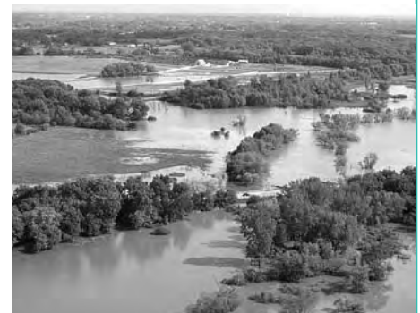
Upper Des Plaines River flood, May 2004

Major floods are a threat to health and safety, impair our local economies, and degrade our community's quality of life.