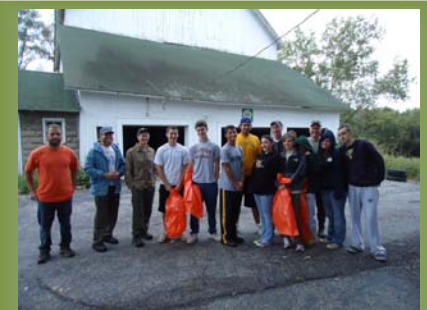
Warren Township High School students at their 2010 “CPR on the DPR” event.