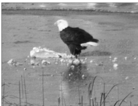
The eagle has landed! An unusual sight in the watershed, this bald eagle was photographed feeding at Lake Leopold this winter.

Lake County Forest Preserves www.LCFPD.org