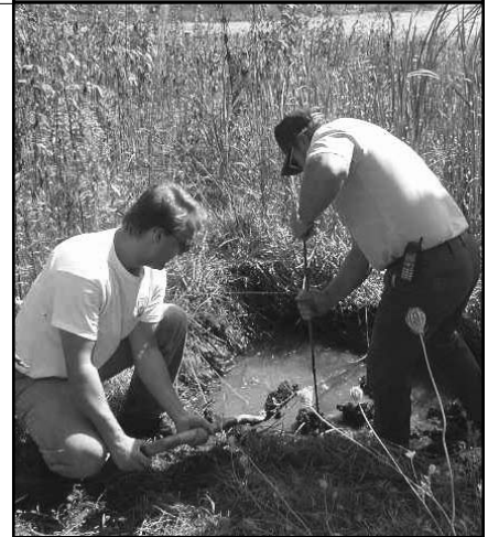
Learn about grants for wetland restoration techniques, like disabling drain tiles (above), at the seminar.

To register for the seminar, email your name, address and phone to upperdesplainesriver@yahoo.com by May 12, 2006.