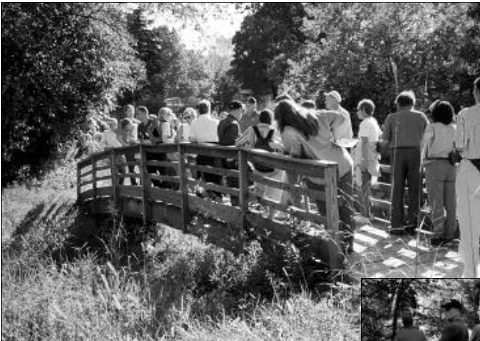
Tour participants examine streambank stabilization efforts at Rivershire Park in Lincolnshire.

On September 23, 2004, an energetic crowd of nearly 40 local watershed enthusiasts participated in an UDPREP-sponsored tour of four restoration projects in the Upper Des Plaines River watershed.